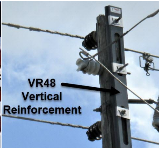
VR48 Vertical Reinforcement